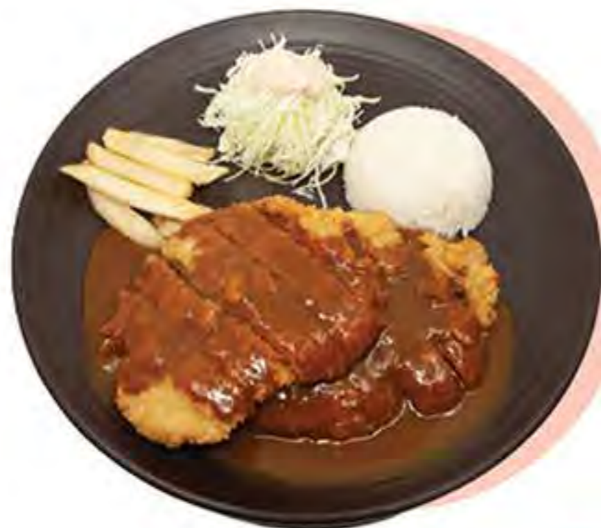
$19 수제 돈까스 Homemade schnitzel