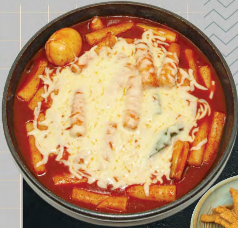
치즈 떡볶이 $16 Spicy rice cake & cheese 🌶️ + fried fish cake 어묵 튀김 $3