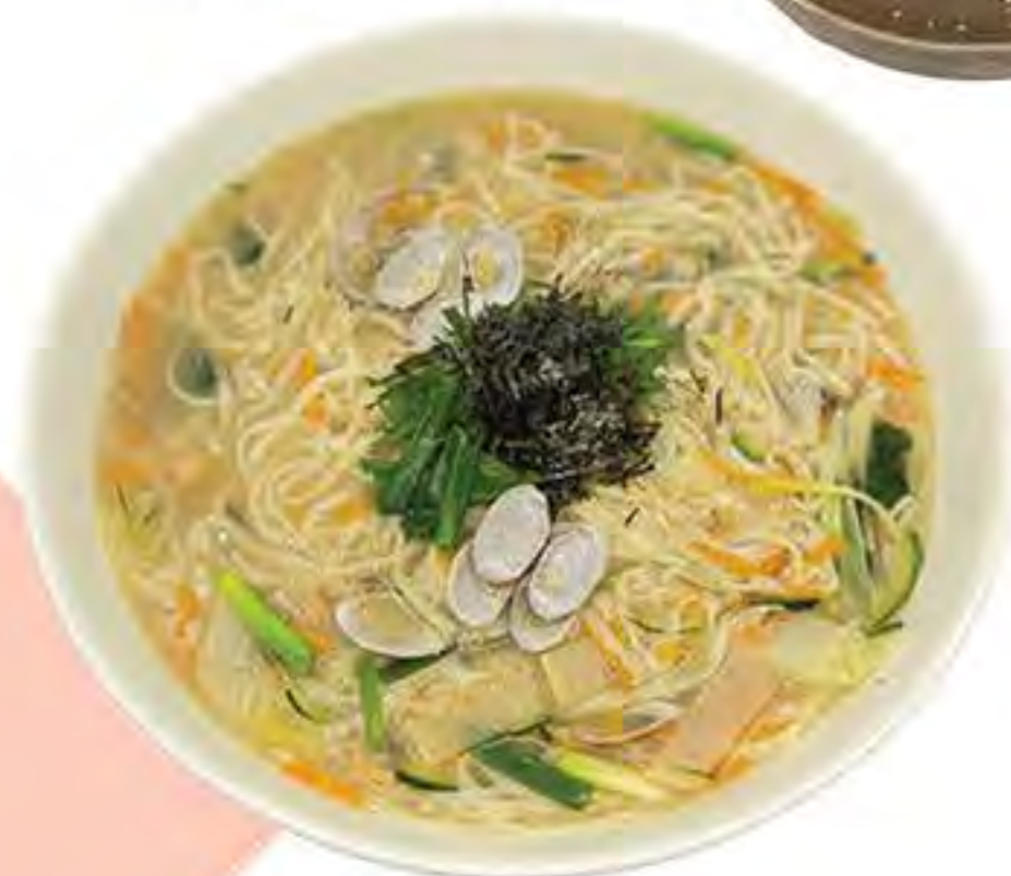
$38 바지락 칼국수 (2인) Clam noodle soup (for 2)