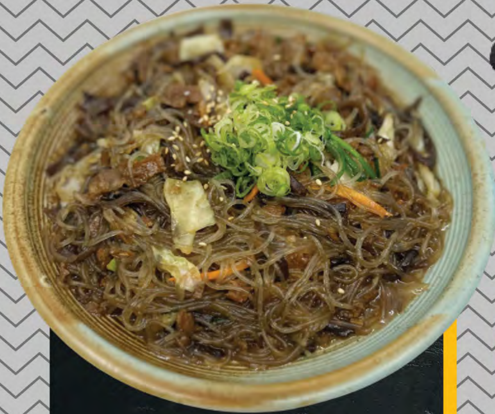
vegetarian available 고기 잡채 $16 Beef japchae