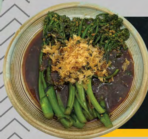
야채볶음 $9 Warm vegetables