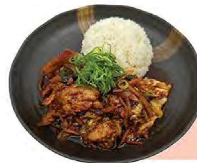
$17 제육 덮밥 Spicy pork rice bowl