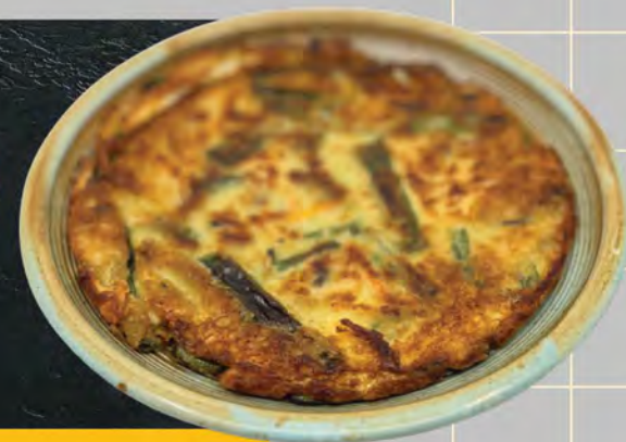
해물 미니 파전 $9 Seafood mini pancake