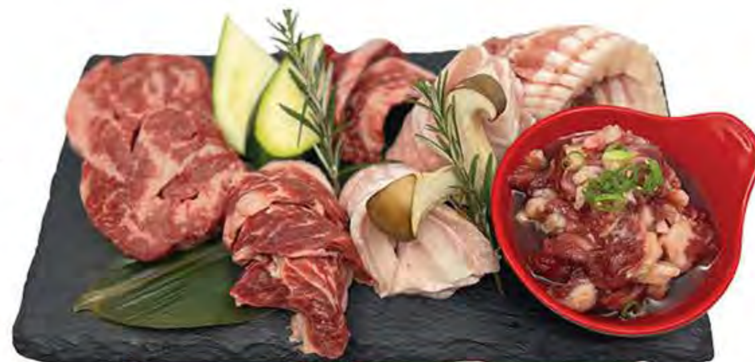
$79 미니 콤보 세트 Mini-combo Set Wagyu, pork & marinade meats