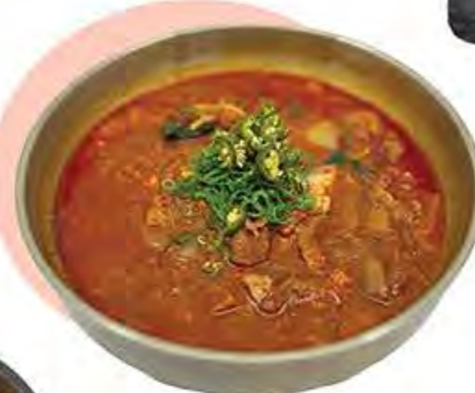
$18 차콜 국밥 Charcoal spicy meaty soup