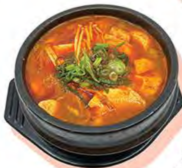
$18 순두부 찌개 (해물, 돼지고기) Spicy soft tofu stew with seafood or pork