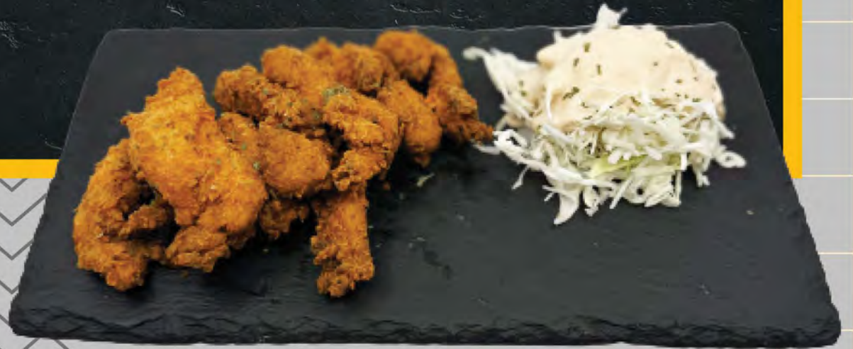
KF-C $16 Korean Fried Chicken