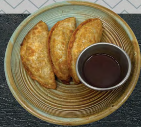
군만두 $9 Fried dumplings